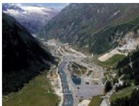
Firing range Hinterrhein