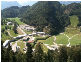
Firing range St. Luzisteig