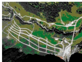
Firing range Wichlen