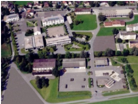
Military training area Walenstadt