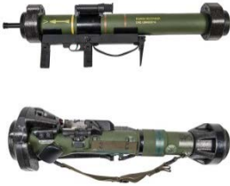
Shoulder-launched multipurpose weapons