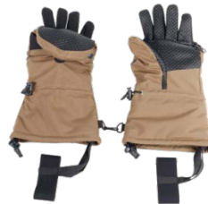
Cold protection gloves 17