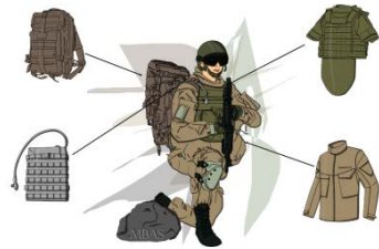
MCES (modular clothing and equipment system)