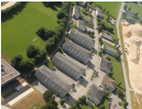
Military training area Bure