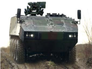
New generation of wheeled armoured vehicles