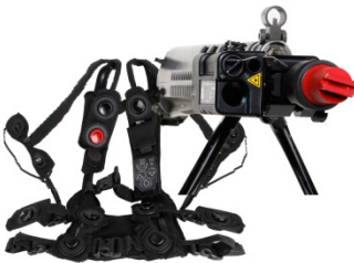
Shooting simulator for assault rifle 90, new technology